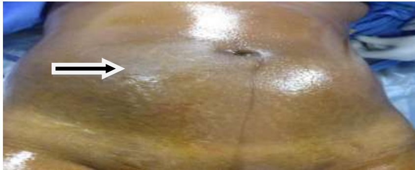
Image 1. shows distension of lower abdomen due to hematoma