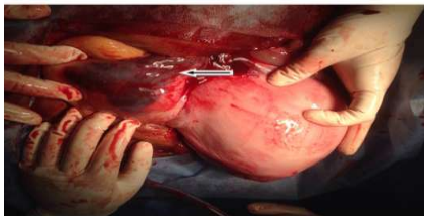
Image 3. shows paravesical hematoma